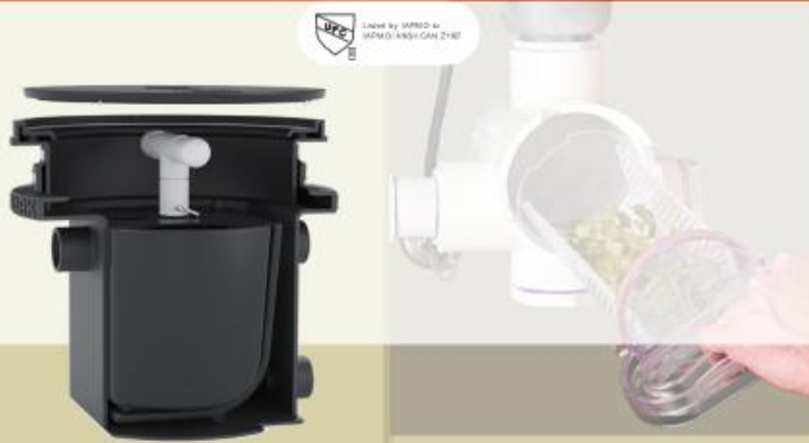
(The Aardvark™ for centralized solids applications)